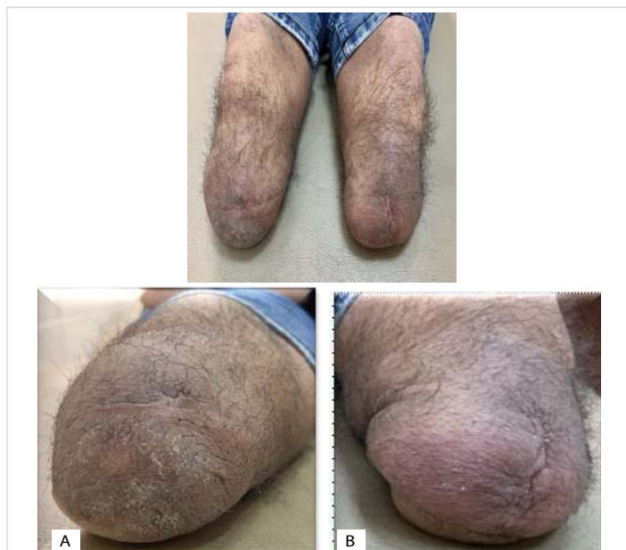
Figure 3: The stumps of the lower limbs after 5 months of treatment : (A) the right side, (B) the left side.